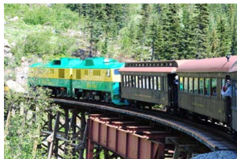
White Pass Railroad

Glorious Canada - big-shouldered mountains chiseled into rugged splendor by glaciers and the elements. Alaska - the people, the places, the beauty. It's like nothing else on earth. And when you visit, Alaska becomes a part of you forever. Let us introduce you to the real Canada and Alaska!