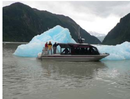
Stikine River Wilderness Tour