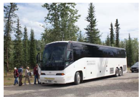
Luxury motor coach

Four distinct groups of people shaped the history of Wrangell: the Tlingit, Russians, British and Americans. Get to know our favourite Alaskan town intimately during our four night stay. Another of our favourite towns, set at the confluence of the Yukon and Klondike Rivers, Dawson City was the centre of the Klondike Gold Rush. These days the town is a National Historic Site. Spend a day wandering down dirt streets, wooden boardwalks and past old buildings leaning on each other for support.