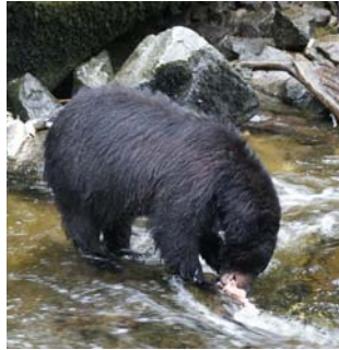
AnAn bear viewing