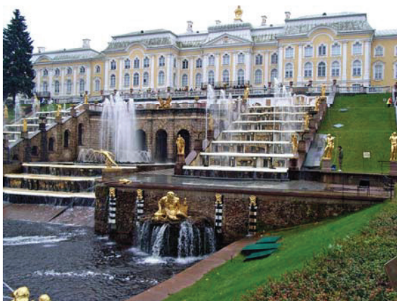
Grand Palace in St Petersburg

Fri 07: Pushkin and Palace of Catherine the Great (B) - today we tour one of the most magnificent and richest residences in Europe. The palace contains exquisite decorative objects, furniture, Russian and West-European paintings, unique collections of porcelain, amber, arms, decorative bronze and sculptures.