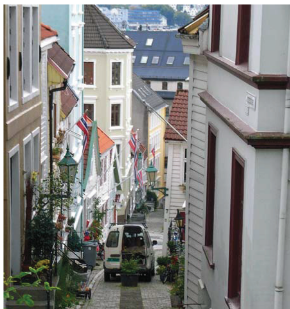
Narrow alley in Bergen