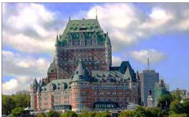
Chateau Frontenac, Quebec