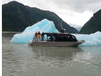
Stikine River Wilderness Tour