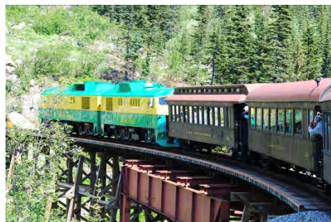
White Pass Railroad

Glorious Canada - big-shouldered mountains chiseled into rugged splendor by glaciers and the elements. Alaska - the people, the places, the beauty. It's like nothing else on earth. And when you visit, Alaska becomes a part of you forever. Let us introduce you to the real Canada and Alaska!