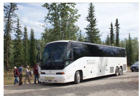
Luxury motor coach

Four distinct groups of people shaped the history of Wrangell: the Tlingit, Russians, British and Americans. Get to know our favourite Alaskan town intimately during our four night stay. Another of our favourite towns, set at the confluence of the Yukon and Klondike Rivers, Dawson City was the centre of the Klondike Gold Rush. These days the town is a National Historic Site. Spend a day wandering down dirt streets, wooden boardwalks and past old buildings leaning on each other for support.