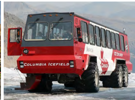
IceExplorer Athabasca Glacier

Discover the towering mountains, shimmering lakes, tree-covered islands, dense forests and kilometers of vast coastline that distinguish British Columbia, as much as Vancouver with its fascinating blend of European and Asian cultures does. With large caribou herds migrating across Alaska's interior, millions of salmon spawning in its rivers and the bears attracted to this fine meal, Alaska provides wildlife viewing at its finest.