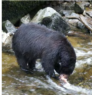
AnAn bear viewing