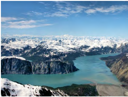
Flightseeing Juneau to Haines